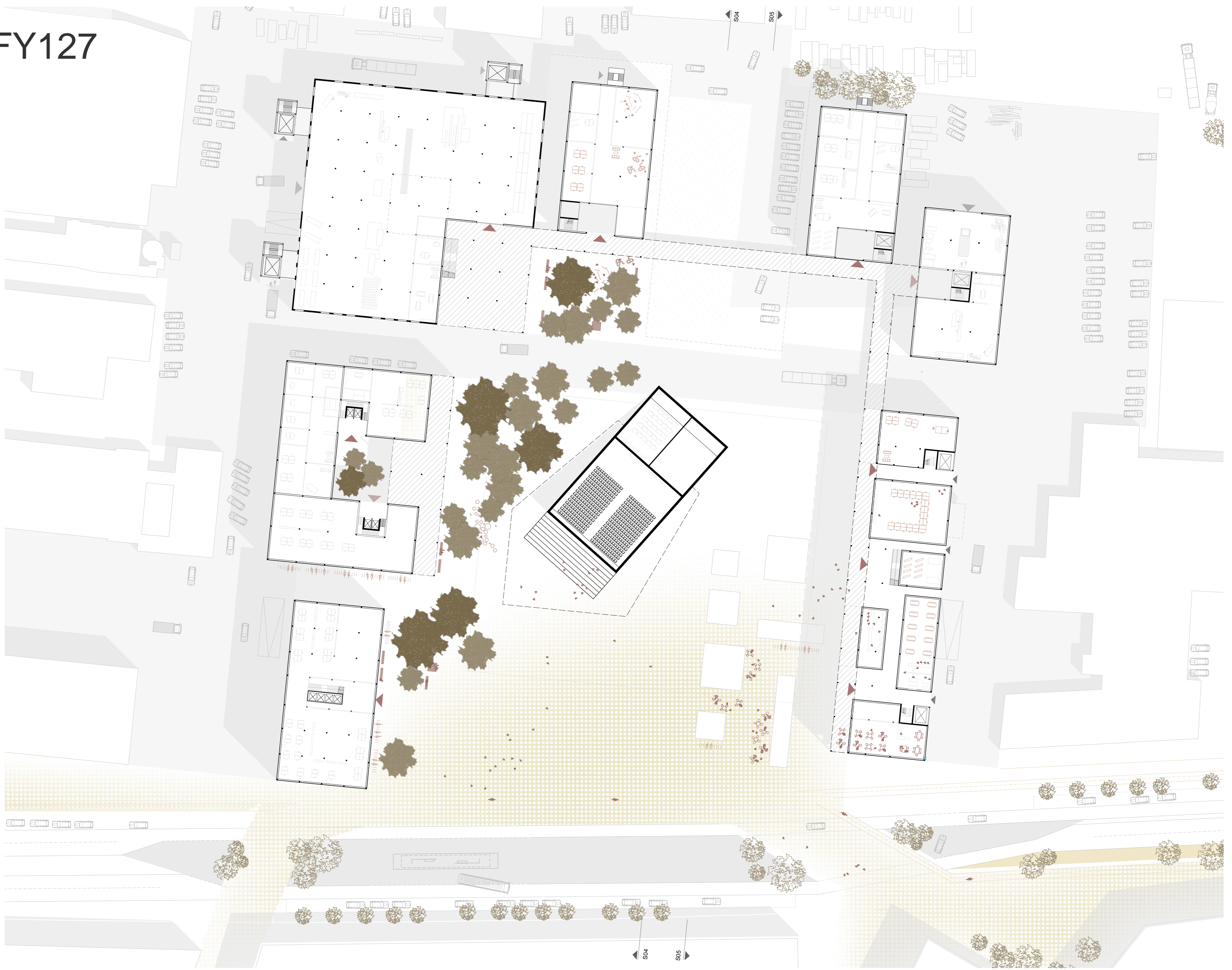
Ground floor plan of the project site // scale 1:500