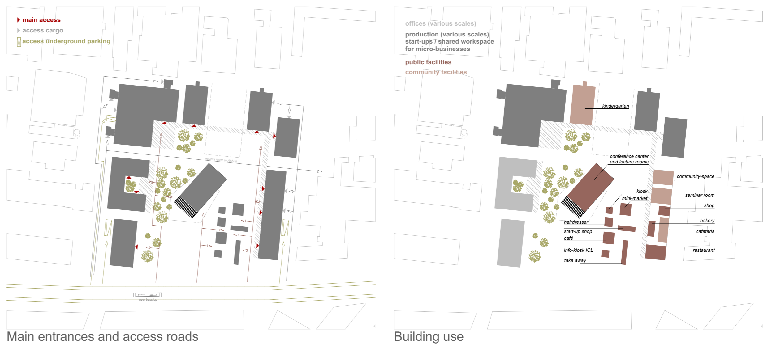
Main entrances and access roads