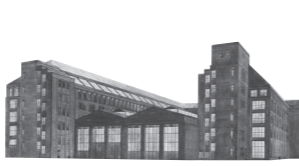
Peter Behrens, Industriekomplex AEG, 1909-13, Berlin-Wedding

Craftsman laboratory Little spaces inside the city. Monofunctional spaces.