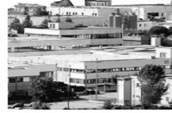
Peter Behrens, Industriekomplex AEG, 1909-13, Berlin-Wedding

Factory Big spaces outside the city. Monofunctional spaces.