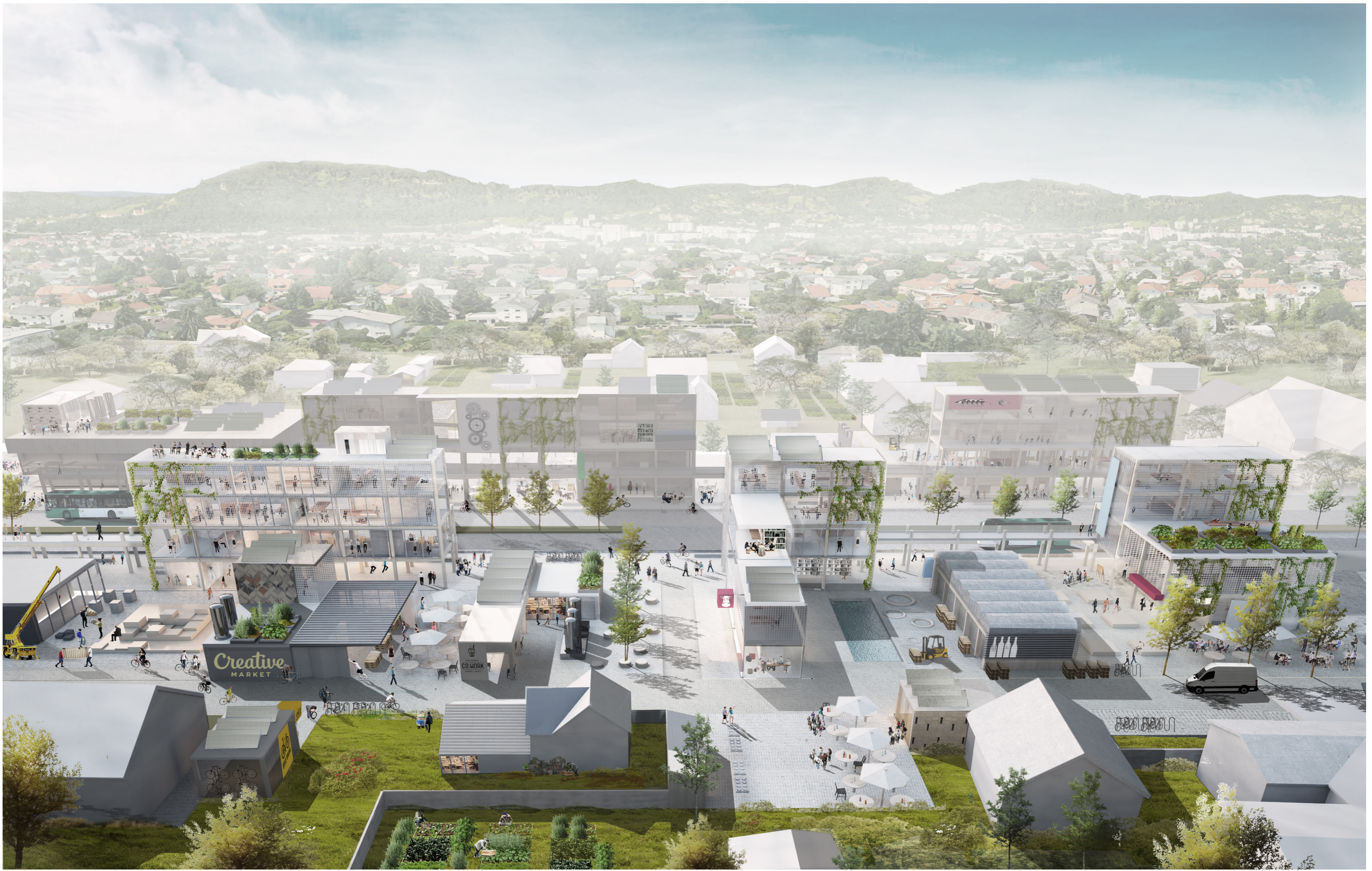
View of new Kärntner Strasse from the residential areas