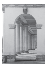
Palazzo Chiericati, Palladio, 1550

Modular structure A vertical structure that allows the crossing.