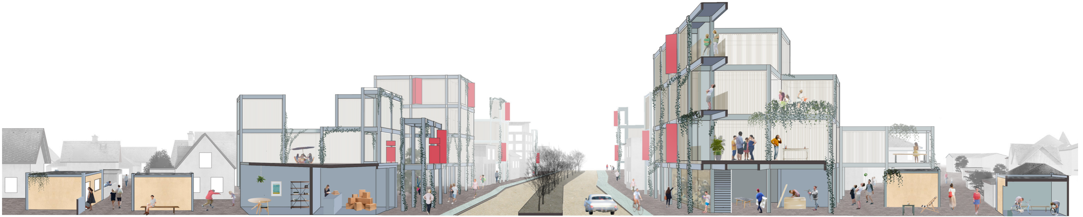
Perspective from street view illustrating the vision for the streetscape of Kärntner Strasse and the relation between the street front and the residential areas in the back

An urban boulevard needs a front, urban density and functional mix. A simple idea for a concrete need: unify the urban front through a modular system that can be used all along the avenue, optimizing construction costs, assembly costs and maintenance costs. Not a finished, forced and absolute project but a project with few elements that can be adapted to the needs of the places, that can grow over time, responding to the changing needs of the city and its inhabitants, supported by an effective economic program.