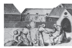
The Alchemist, Engraving, by Philip Galle 1537-1612, Netherlands

Craftsman laboratory Little spaces inside the city. Monofunctional spaces.