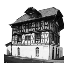
Traditional building, Alps.

Accessibility A simple access device. Intermediated space.