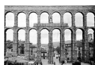
Aqueduct of segovia, Spain 100 A.D.

Modular structure A vertical structure that allows the crossing.