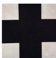
Black cross, Kazimir S. Malevich, 1915

The irrational city. City without order or hierarchy